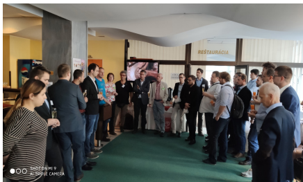
Participants gathering together at PDES 2019

The conference program focused on a broad range of techniques, approaches and problems relevant for the latest research in the area of the design and application of programmable devices and systems and discussed the status and future trends of this particular branch of applied electronics in control and information technology. It included plenary lectures, technical sessions, poster and interactive sessions and software presentations. Academic researchers and lecturers in control, R&D specialists in instrumentation, control and industrial automation, and practicing control engineers from a variety of industrial sectors found it especially rewarding.